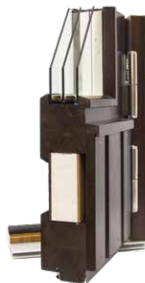
Balcony door EPO 70 mm

The wooden frame structure is made from finger-jointed laminated wood and is the strongest on the market. The ventilated aluminium cladding is attached using durable aluminium brackets. Triple glazing and EPS insulation. The threshold has a durable aluminium bar and the front moulding has a handy snap-in insert for attaching a threshold plate.