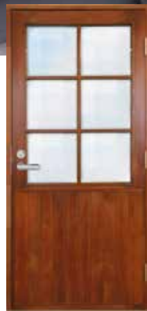
EPO panel door