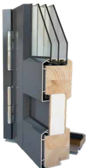
Balcony door EPO-A 80mm

Weather-resistant HDF panels and aluminium reinforcement on both sides. Double frame structure and EPS insulation. The threshold has a durable aluminium bar and the front moulding has a handy snap-in insert for attaching a threshold plate. Sound and fire insulating structures are also available for the 90 mm thermal door structure.