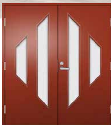
117 doors as double doors