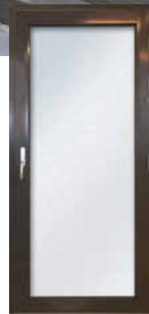
EPO-A full glass