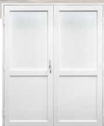
EPO-A doors as double doors