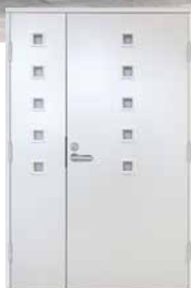
407 with side panel