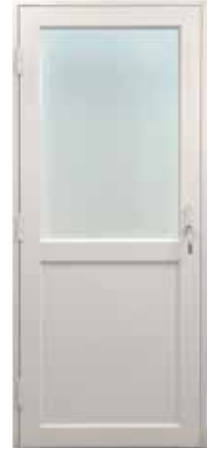
EPO-A 41 dB

Lammin's range of soundproof doors contains performance-tested doors for noise mitigation regardless of the source. These models are also made to meet your needs – the size, colour and furniture can be customised to your wishes. Soundproof doors are also available as aluminium-cladded balcony and patio doors. If you want to keep noise outside your home but retain warmth, a Lammin door is the right choice for you.