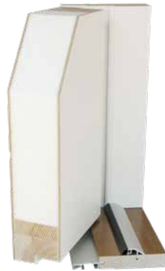
Thermal exterior door PLUS 90 mm

Weather-resistant HDF/aluminium sheets on both sides. Double frame structure and EPS insulation. The threshold has a durable aluminium bar and the front moulding has a handy snap-in insert for attaching a threshold plate.