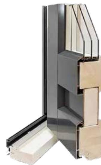
Balcony door REPO 80mm

The wooden frame structure is made from finger-jointed lamellated wood and is the strongest on the market. The ventilated aluminium cladding is attached using durable aluminium brackets. Triple glazing and EPS insulation. The threshold is varnished birch.