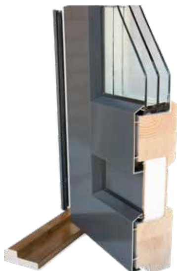
Balcony door SEPO 80mm

The wooden frame structure is made from finger-jointed laminated wood and is the strongest on the market. The panel is surface-treated before assembly. Triple glazing and EPS insulation. The threshold has a durable aluminium bar and the front moulding has a handy snap-in insert for attaching a threshold plate.