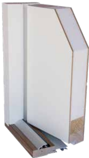
Thermal exterior door 70mm